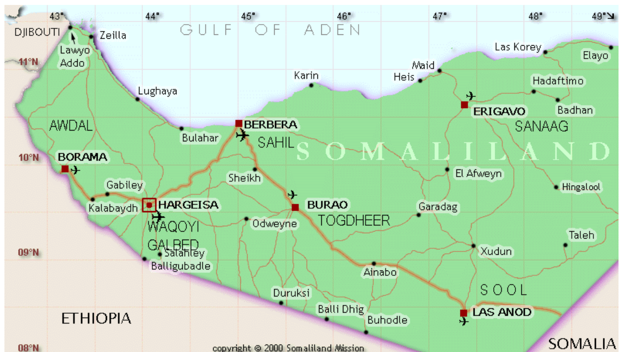
Figure 1: The regions making up Somaliland /2000 Somaliland Mission.

After Somaliland declared itself an independent nation in 1991, it embarked on an impressive process of reconciliation and reconstruction. The achievements of the latter include the preservation of relative peace and stability as well as the advancement of a democratic political system. This, in turn, has opened up opportunities for progress on a number of reforms and development agendas and innovations, driven by a mix of public and private sector actors, also of importance for climate change related matters (from local governance, poverty alleviation, infrastructure, assistance to the rural sectors, emerging new markets etc.). In sum, Somaliland is currently a fast-changing context, within which significant economic, political and environmental challenges and constraints, combined with a number of opportunities and innovations, deserve further attention.